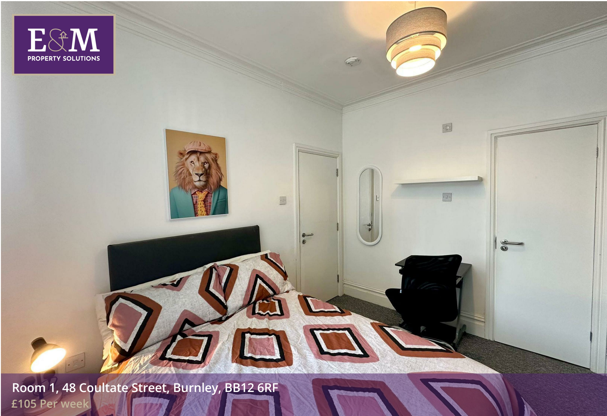
Room 1, 48 Coultate Street, Burnley, BB12 6RF £105 Per week